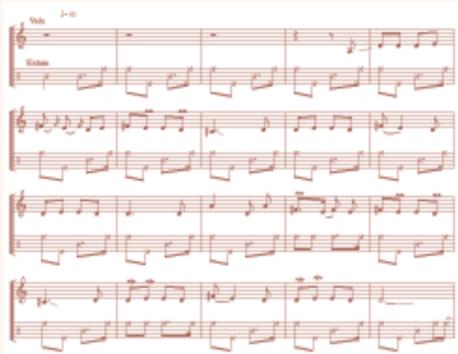
Fig.1b : Janaki's version. Tune 2 combined with a cycle of 2 beats.